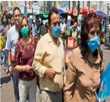
To protect themselves from the virus, some people shield their faces while in public places.